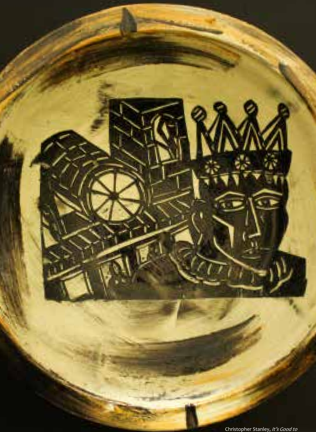
Christopher Stanley, It's Good to be King (detail), 2003, stoneware